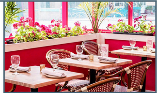
Photo size is 1" height x 1.65" width (Must be interior (full or partial) or exterior of business)

35-03 Broadway, 929-349-1228, rutaaoaxacamex.com Serving Authentic Mexican cuisine in a fun, colorful atmosphere. We also serve beer, wine and spirits. Open M-Th: 12-10, F-Su: 12-11.